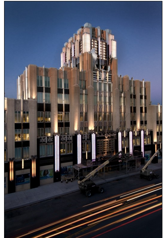
The “NiMo Building” - National Grid Syracuse Office Complex Building A

For the facade restoration, the list of priority items included: replacing deteriorated cast stone elements; removal and replacement of coping stones to allow installation of proper flashings; repairing deteriorated sections of parapet walls; and removing all caulking, sealants, and older repair materials which prevented moisture from escaping