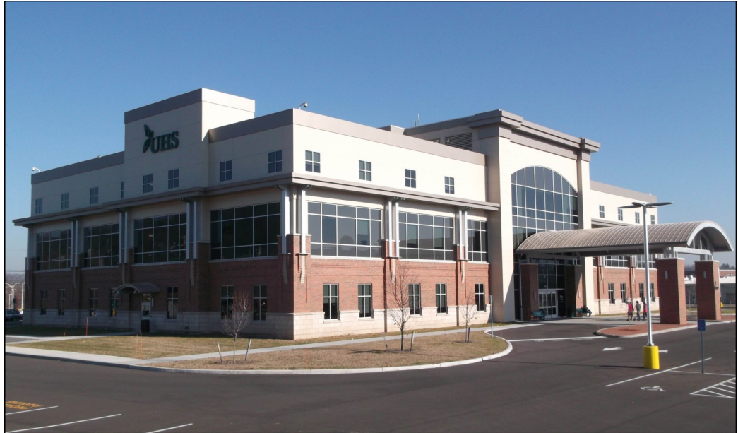
UHS Vestal Extension Clinic - Vestal, New York